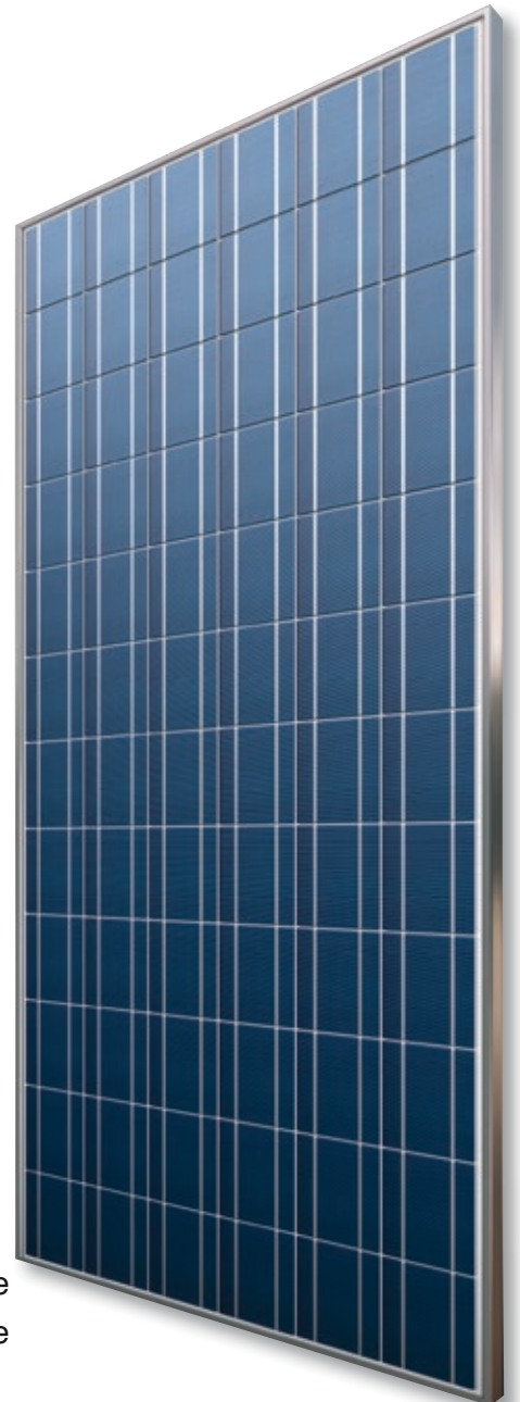
Fig. similar 72P156USA170308A

IP 67 High quality junction box and connector system for a longer life time